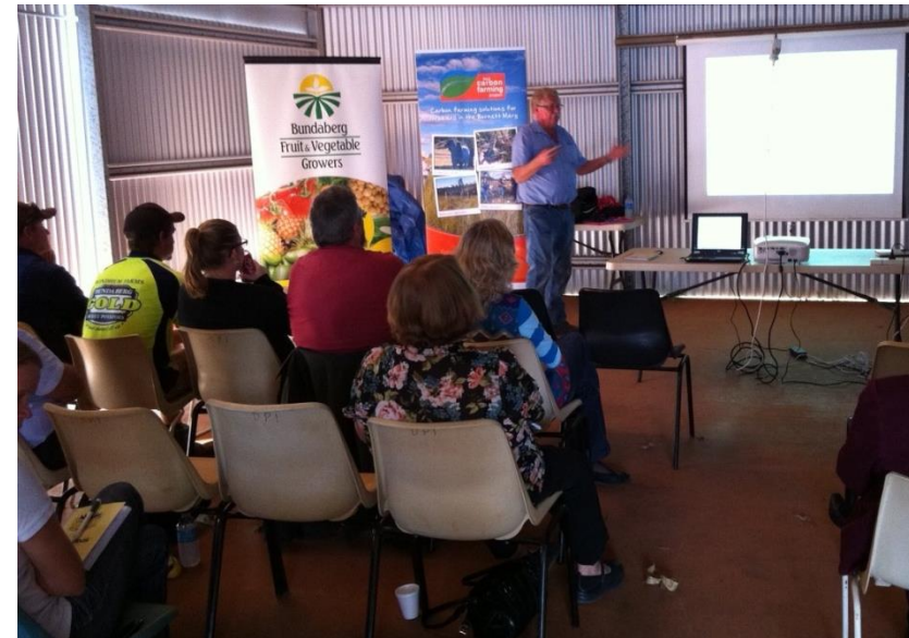
Bundaberg workshop 18/06/14